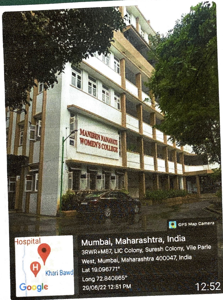
The College Premises