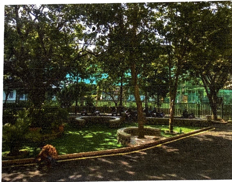
Front Garden and the Open Space of the Building

The college is located in 1.83 acres of land. The total area is 7613.6 sq. mts. The built-up area of the college is 7237.43 sq. mts. The College is proud of its quiet, serene, lush green campus, a rare privilege in a metropolitan city of Mumbai. The building is an impressive ground plus five storey structure, airy, lighted, well built and nicely maintained. Cleanliness, hygiene and eco-friendly practices are the striking features of the campus.