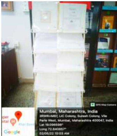
List of Braille Books in Library