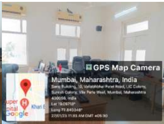
5.11 Language Lab