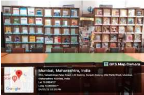
Library Periodical Section