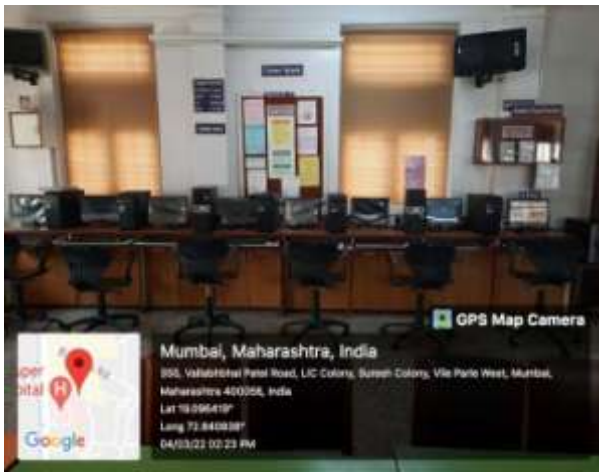
Library Cyber Space Area