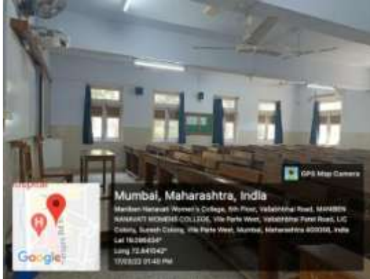
2.3 Smart classroom