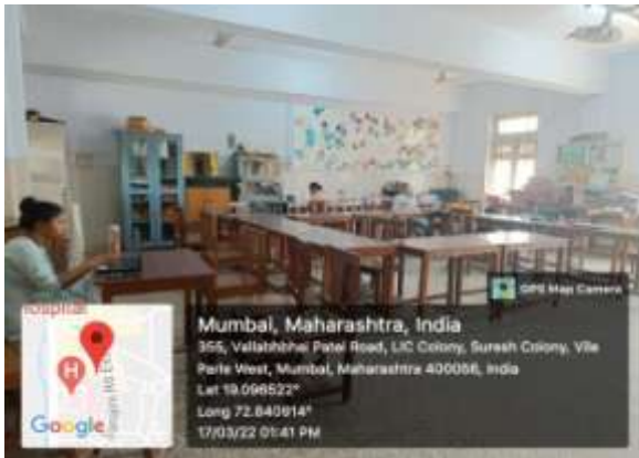
Psychology Lab (2nd floor) 2.2