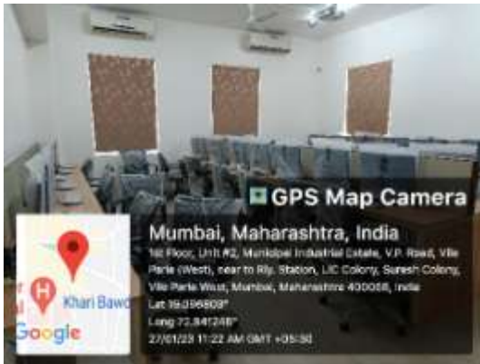
3.8 computer lab: ICT