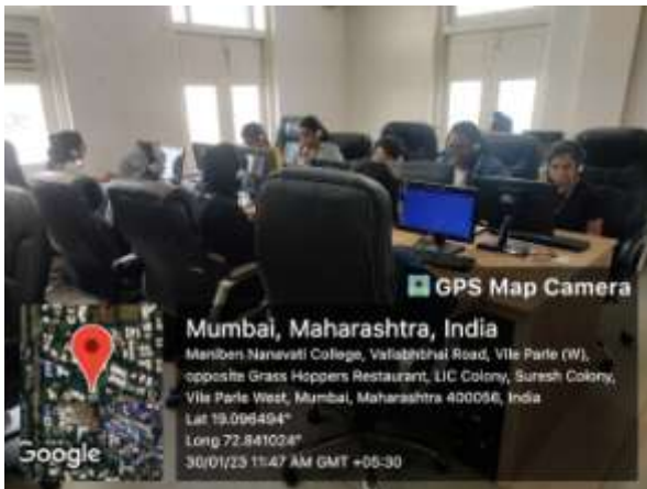
Language Lab Equipment