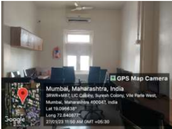
5.6 Computer Lab