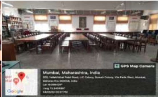
Main Library Reading Hall