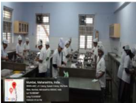
1.1 Food and Nutrition lab.