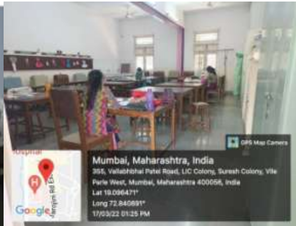
1.2 Textile Lab