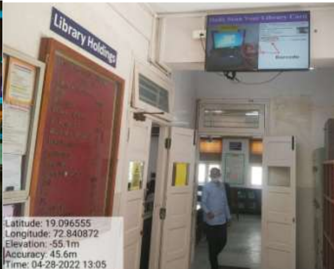
Library Digital Signage