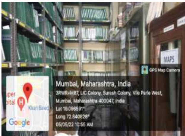
Library Old Record room