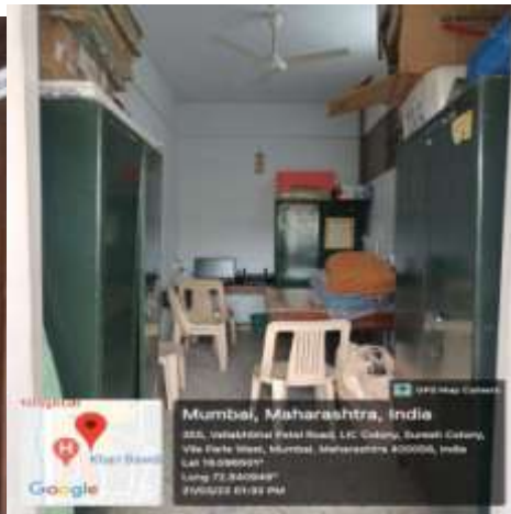
NSS Room 2.4 A