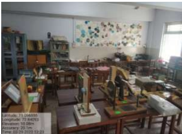
Psychology Lab with Equipment