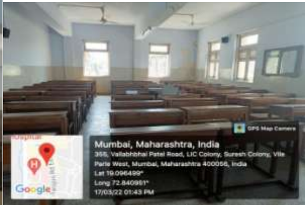
2.1 Smart classroom