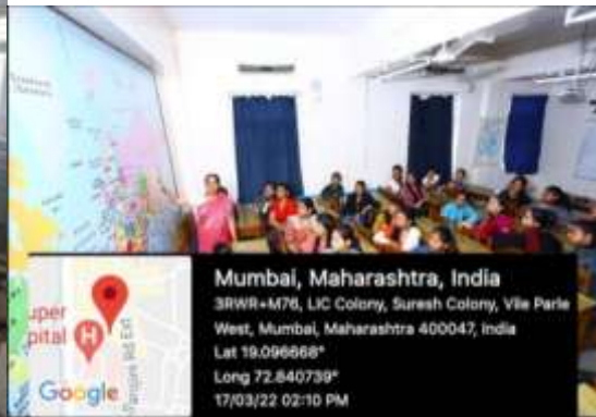
5.2 TTM Classroom