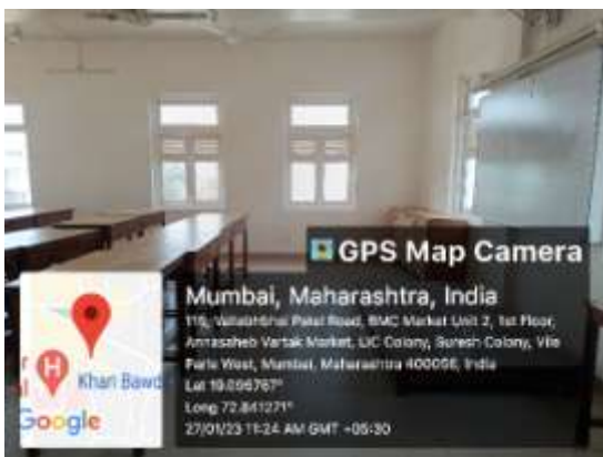
4.1 Interior Design Lab