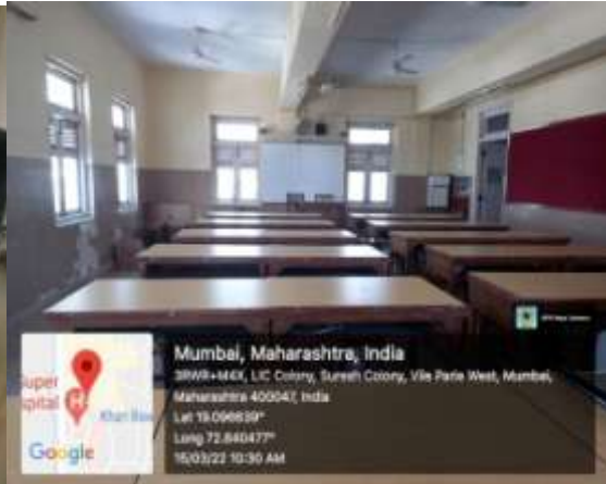
4.1 Interior Designing Lab