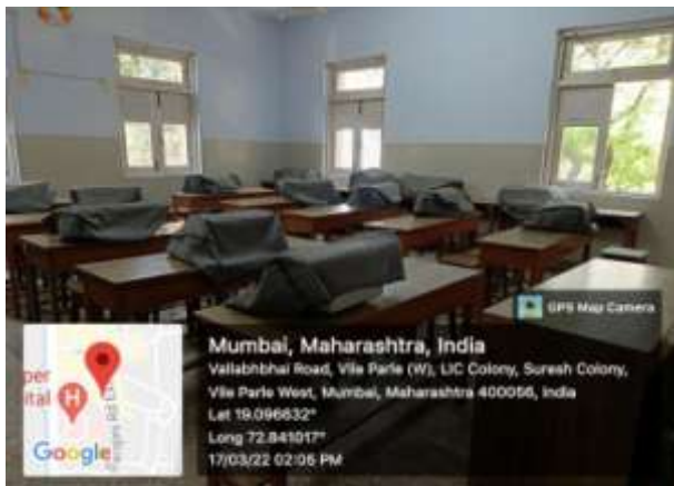
2.8 OM & SP Class