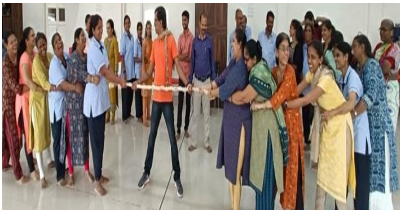
One Day Workshop “Building Relationship at Work Place” on 15 th October, 2022.