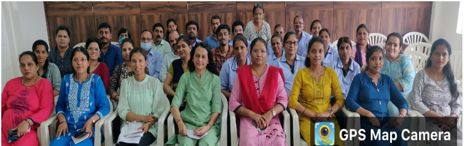
Staff Welfare Activity “Immunity during COVID Times” organized on dt. 3 rd August 2022