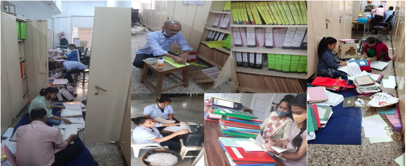
Five Days Workshop on “Handling Physical Records Management” from 25 th April 2022 to 29 th April 2022.

Attended/ Conducted Seminars/ Workshops/ Training to improve skills & knowledge to raise the level of performance to support the Department's Goal and Mission