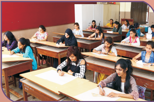
Art & Design Room