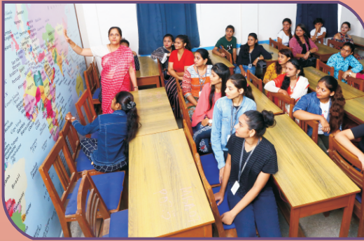
Travel & Tourism Room