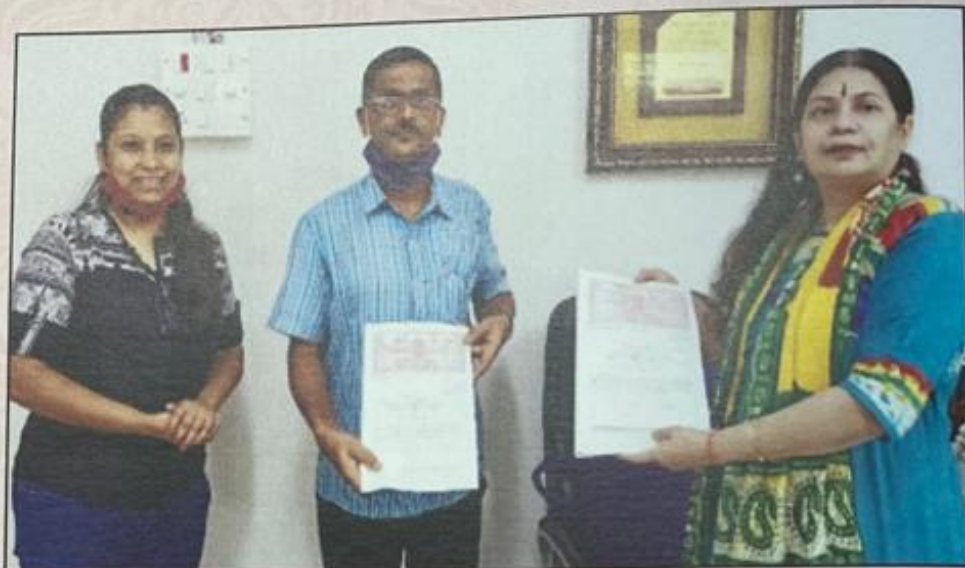
Signing of MOU with The Yoga Institute, Mumbai