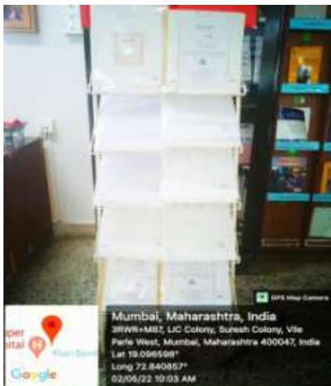
List of Braille Books in Library