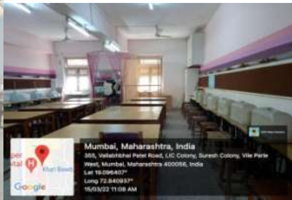
1.3 Pattern and garment construction