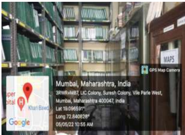
Library Old Record room