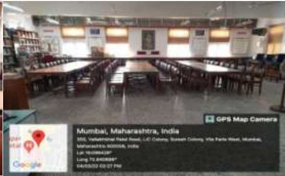
Main Library Reading Hall