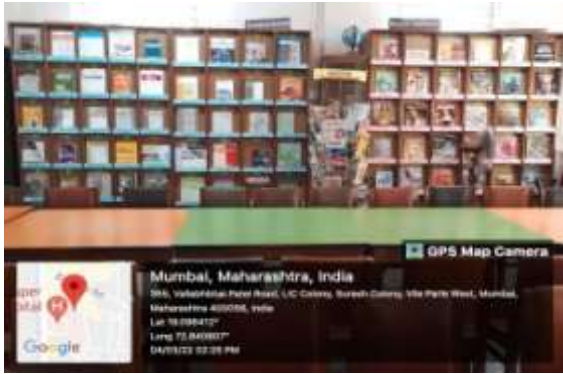
Library Periodical Section