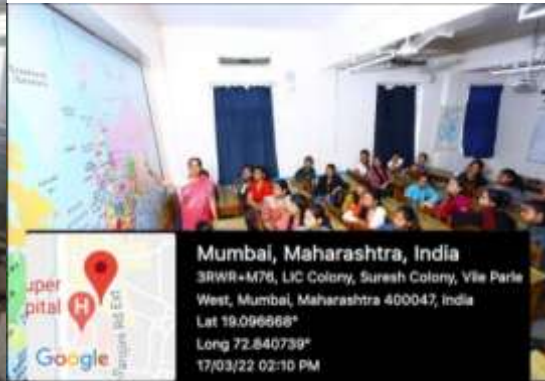
5.2 TTM Classroom