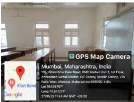
4.1 Interior Design Lab