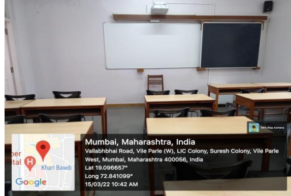
Smart Class Room