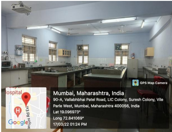
Food & Nutrition Lab