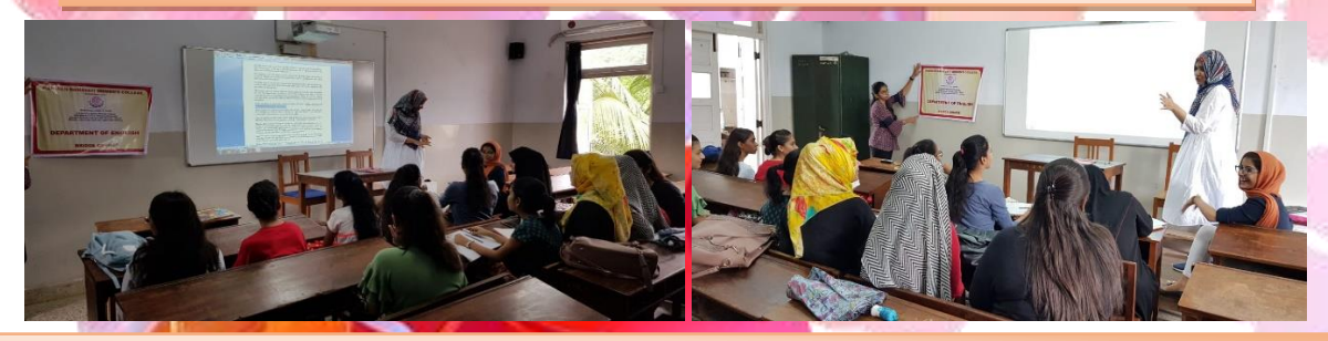
PPT presentations, Debate Sessions, Listening Skills using ICT tools by TYBA [E] students