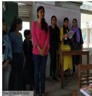
Time: 27/08/2019 10:42