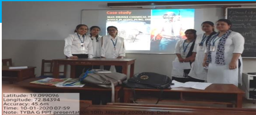
Latitude: 19.099096 Longitude: 72.84394 Accuracy: 45.6m Time: 10-01-2020 07:59 Note: TYBA G PPT presentation on 30th January 2020, Erandol