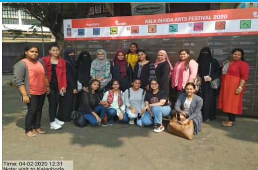
Time: 04-02-2020 12:31 Note: visit to Kalaghoda