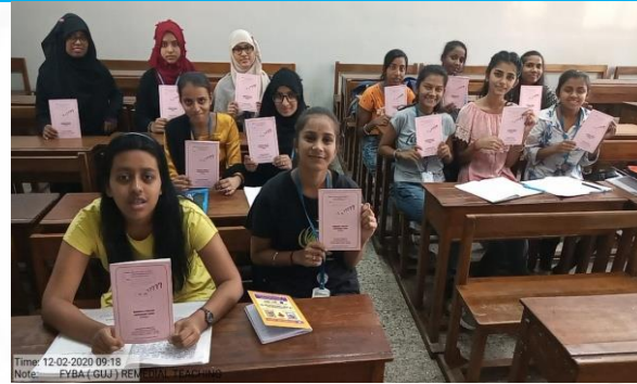
Time: 12-02-2020 09:18 Note: FYBA+GUJ MED

Group Discussion on Social Issues by the SYBA CC English students