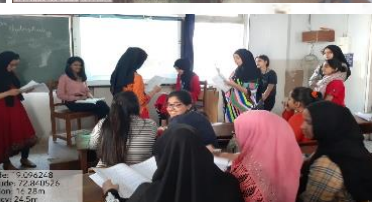
TYBA English PPT presentations, Scene Enactment on Girish Karnad's Play "The Wedding Album" and Group Discussions on social issues