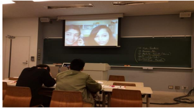
Extension of Project S.P.E.A.K JISEPOL - A Japan-Indo Student Cultural Exchange Program Online on 20 th Nov 2019