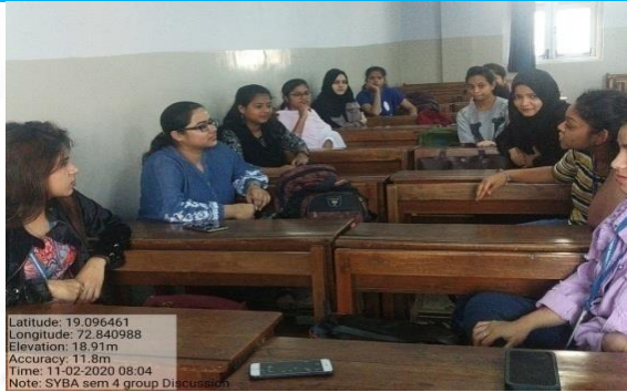
Latitude: 19.096461 Longitude: 72.840988 Elevation: 18.91m Accuracy: 11.8m Time: 11-02-2020 08:04 Note: SYBA sem 4 group Discussion

FYBCOM PRESENTATIONS on Women's Issues : skits, debates, charts based on the text Empowerment English