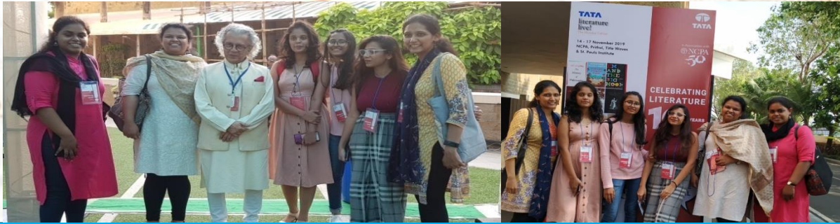
Visit to TATA Literature Live Festival on 14 th Nov 2019