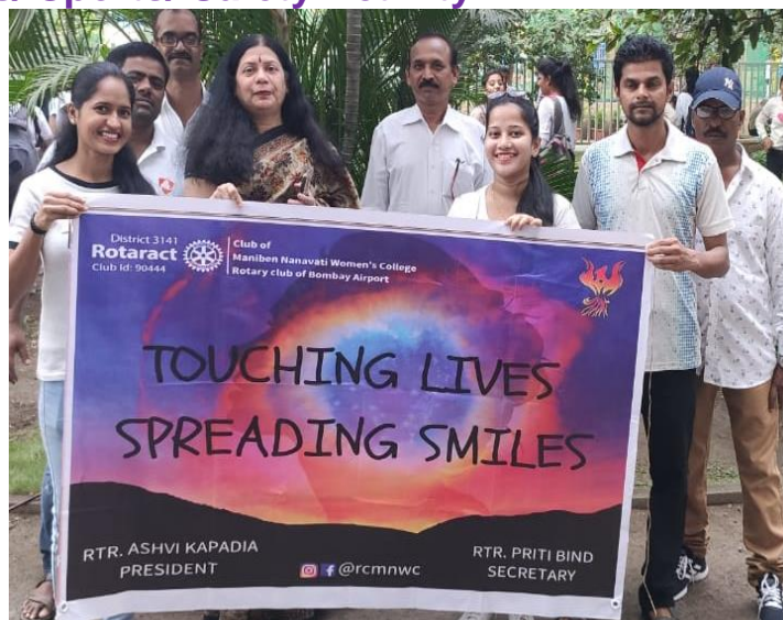
Maha Walkathon was to acquaint public about road safety, responsible driving, helmet safety & traffic rules, 30.11.2019