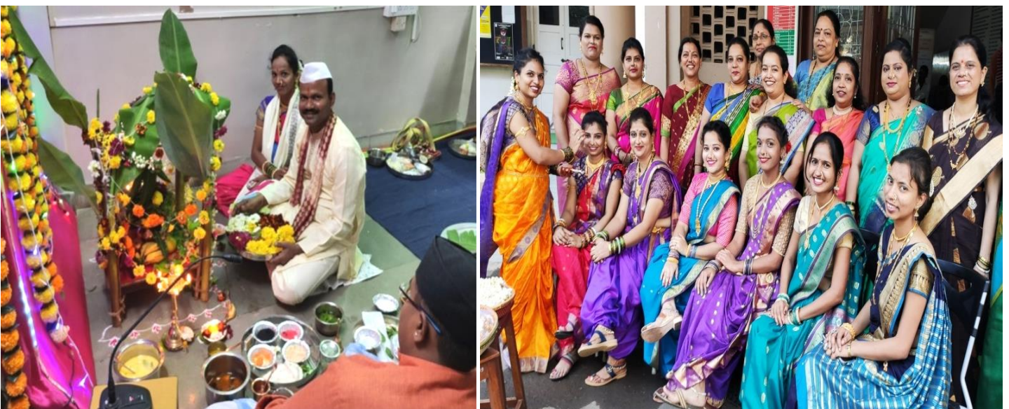
Spirituality & Tradition Meet: Satyanarayan Pooja & Haldi Kum-kum Ceremony on 25.01.2020