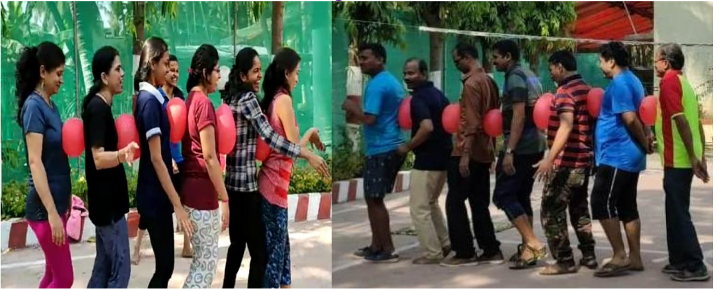
Recreational Activity for Non-Teaching Staff Members conducted on 04.01.2020 at Madhuvan Farms, Alibag