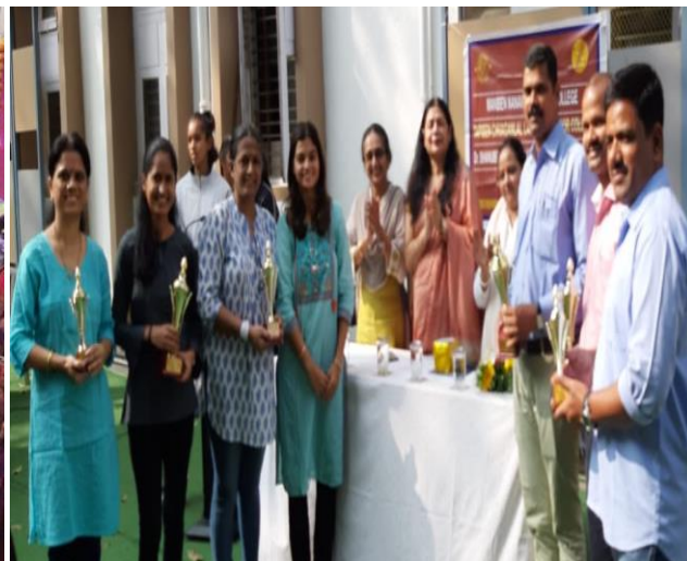
Sports – 23.12.2019