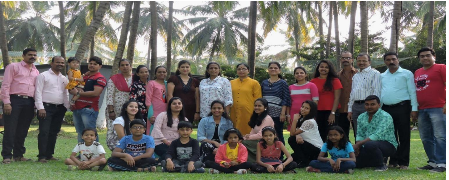
Two Days Team Building Activities for Non-Teaching Staff at Madhuvan Farms, Alibaug, 04.01.2020 & 05.01.2020