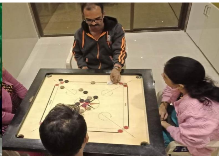
Sports Activity for Non-Teaching Staff conducted at Madhuvan Farms, Alibag, 04.01.2020