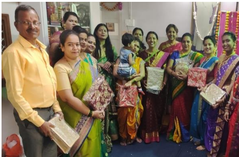
Cultural Events – 19.10.2019