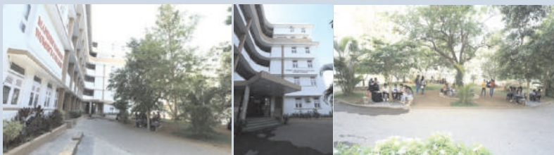
Our College – Our Pride