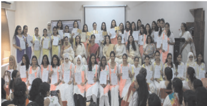
Degree Distribution Function for the batch 2018-19, 24th January 2020. Ms. Anuradha Pal, the internationally acclaimed Female Tabla Player was the Chief Guest.