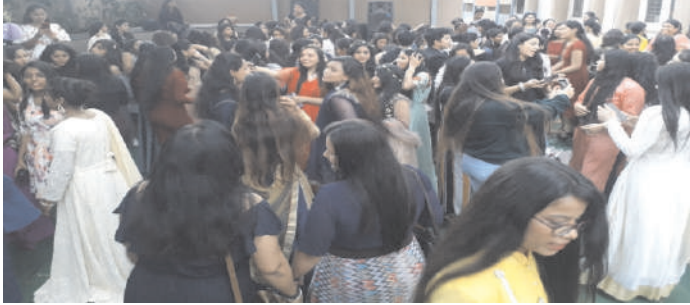
Alumni Meet held on 29th February 2020. 83 Alumni from 1990-91 batch onwards participated.