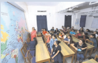
Travel & Tourism Classroom