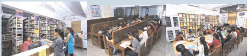
The College Library