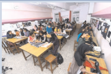
Fashion Designing Lab