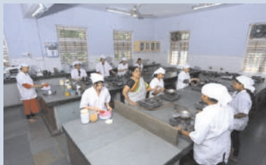
Food and Nutrition Laboratory