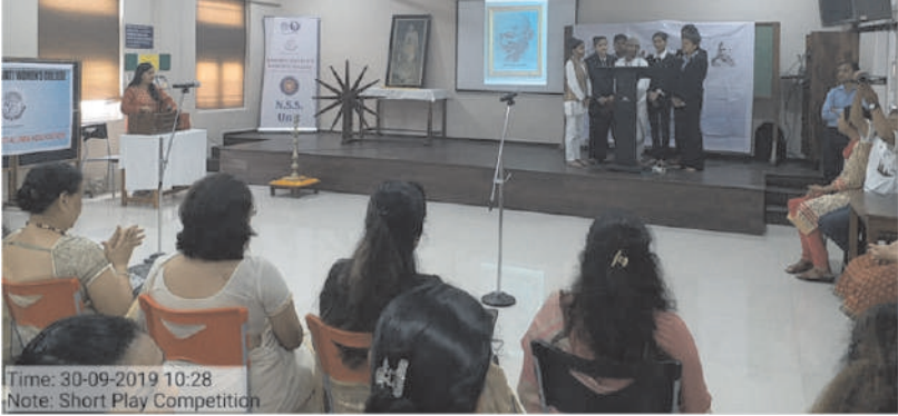
Time: 30-09-2019 10:28 Note: Short Play Competition