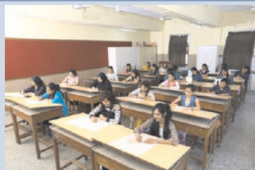
Interior Designing Lab